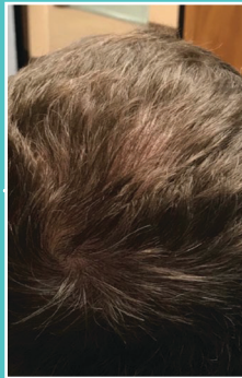
3 months after three treatments using 0.5cc of product